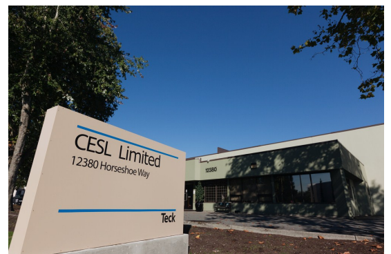
Teck's Hydrometallurgical Testing Facility

To learn more, please visit our website at www.cesl.com