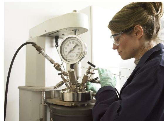
CESL Bench Autoclave Testing